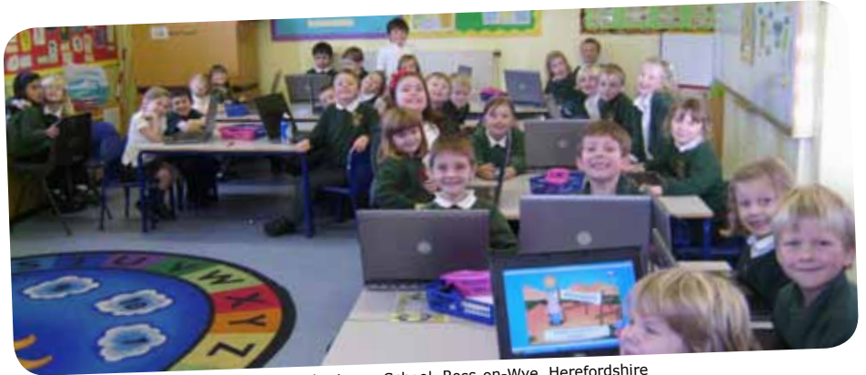
Class at Walford Primary School, Ross-on-Wye, Herefordshire

EducationCity.com welcomed in its 12,000th subscribing school in October - Walford Primary School in Herefordshire! The school joined us after taking part in Herefordshire's Local Authority-wide trial, and they are now enjoying the resource on their Whiteboards, computers and for homework.