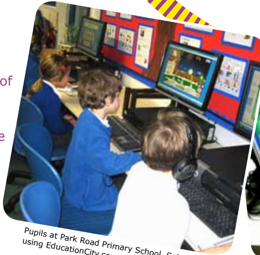
Pupils at Park Road Primary School, Sale using EducationCity.com

"EducationCity.com", she enthuses, "really motivates the children to practise their basic skills. They use it both in lessons and at lunchtimes, and the ability to track their progress quickly helps our class teachers to ensure that different attainment groups are given the support that they need."