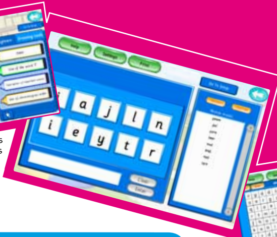
The new Literacy Topic Tools for text features, letter tiles and word searches

Take a look today to see where they can make your lessons more interactive. You'll find them beside the Activities in the Subject Select page. And within the revolving "i" button, you will find details of activities best suited to follow on from them.