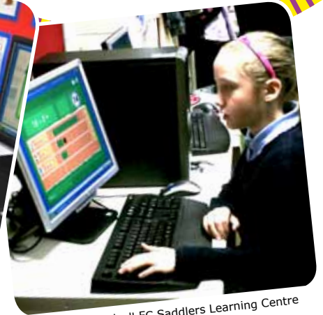
Pupils at Walsall FC Saddlers Learning Centre on Play Live